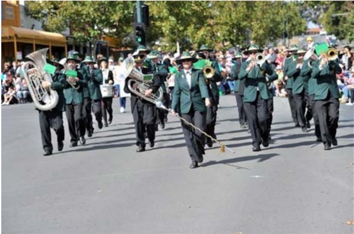
Bendigo Advertiser Webpage. Bendigo Easter Parade 24/04/2011