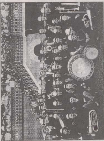
SOUND: Flight's City Band outside the Upper Reserve Grandstand at the QEO.

His name appeared often in editions of the Bendigo Advertiser as an accompanist at charity concerts and he was for many years the