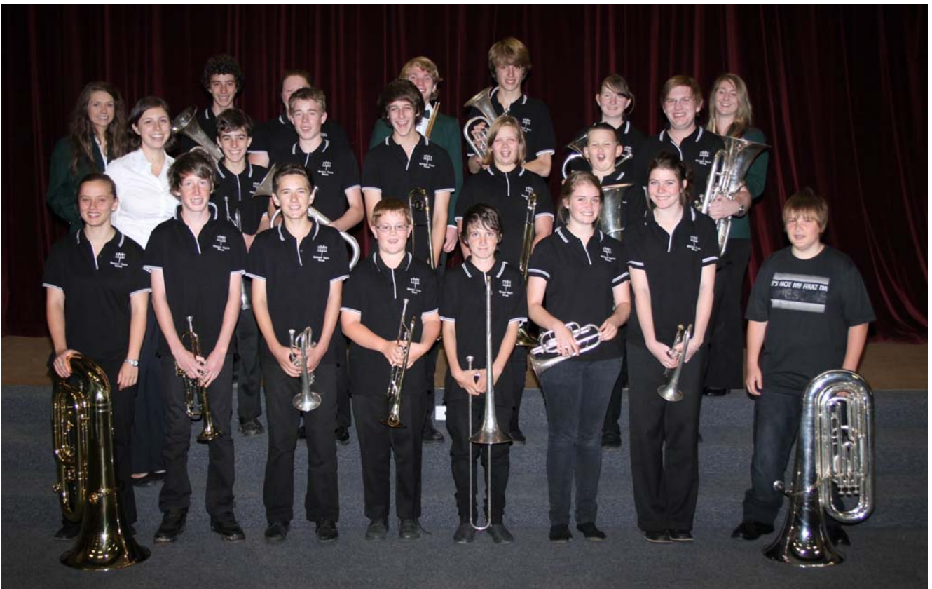
Bendigo Youth Brass