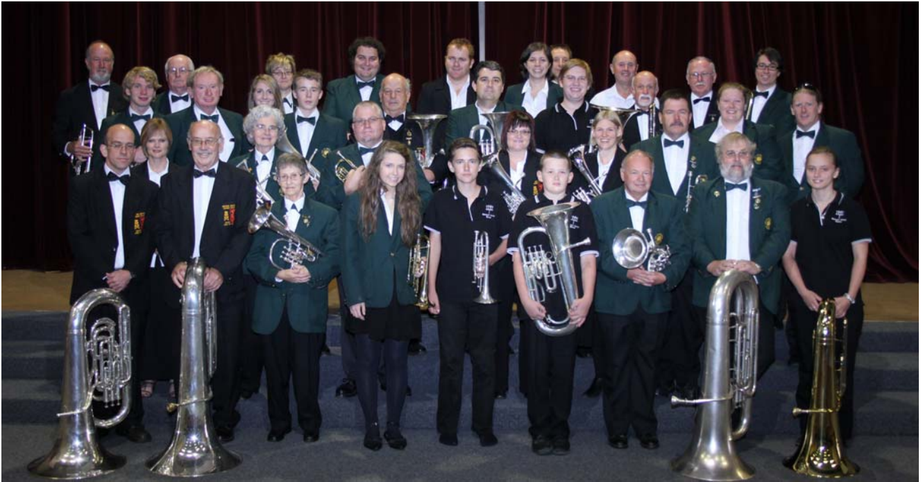
City of Greater Bendigo Brass Band