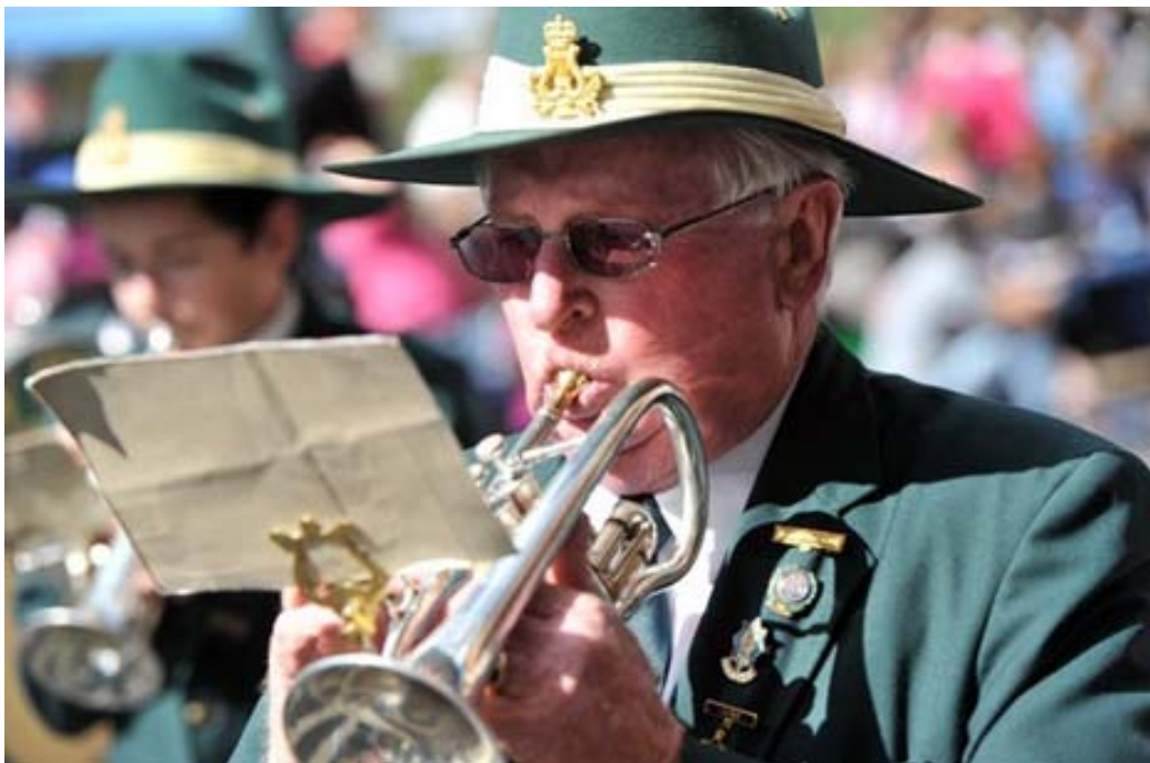
Bendigo Advertiser Webpage. Bendigo Easter Parade 24/04/2011 Photographer: JIM ALDERSEY