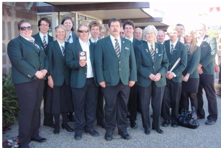
Ballarat Comps, runners up!