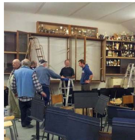
Installing trophy cabinets. Perfect fit!